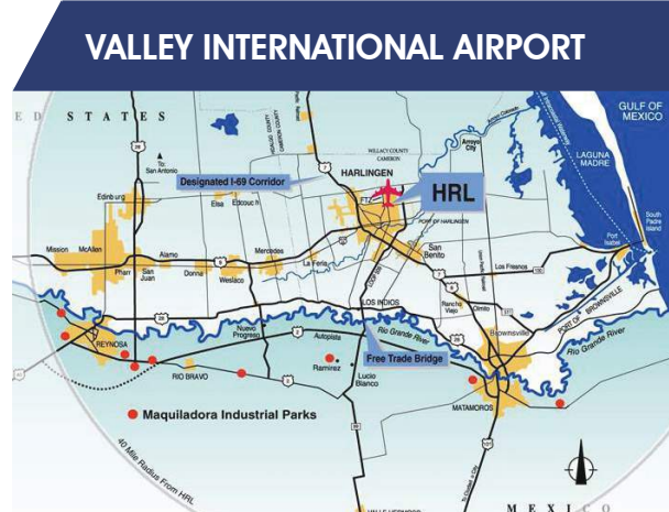
U.S. - Mexico Border Area Along the Lower Rio Grande Valley